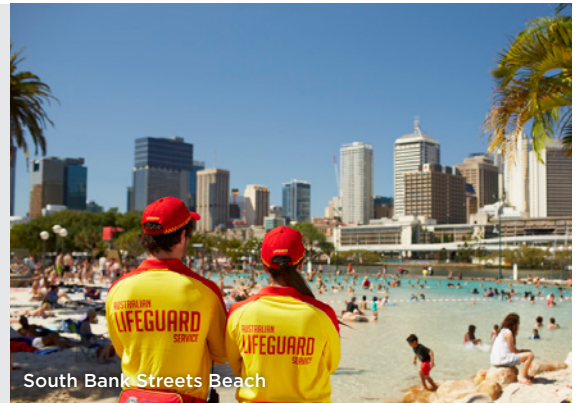
South Bank Streets Beach