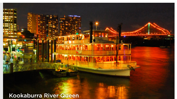
Kookaburra River Queen

For more on Brisbane touring and attraction options visitbrisbane.com.au