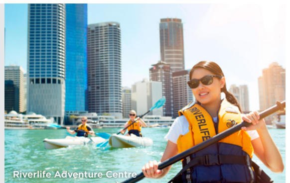
Riverlife Adventure Centre