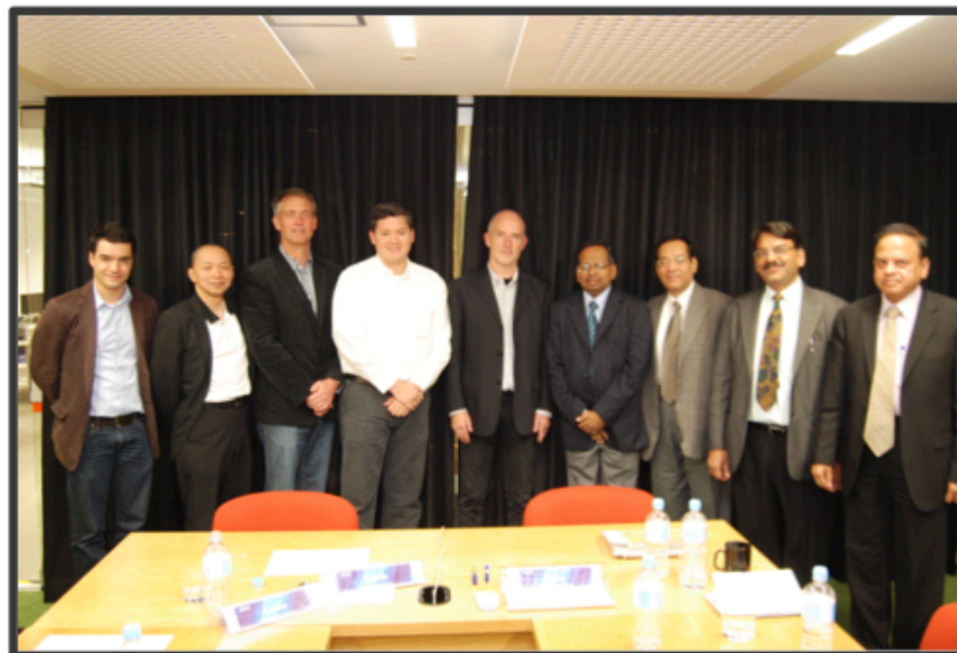
High-level meeting: APNIC, NIXI and government reps. from India