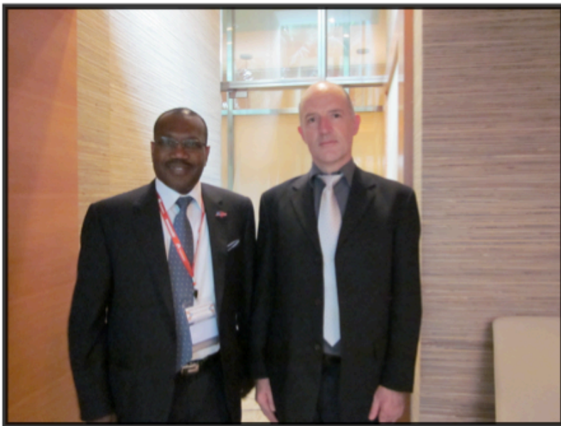
With Dr. Hamadoun Touré, SG of ITU