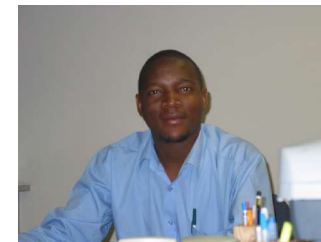
Engineering & IP Analyst