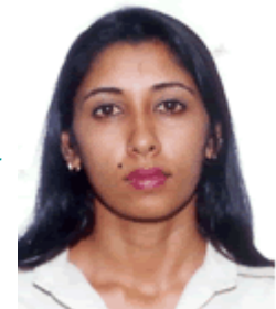
Business and Administrative Assistant