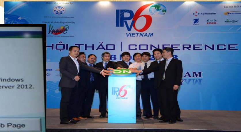
Minh Thang - vice Minister of MIC and CEO of 8 top launched IPv6 service on the Vietnam IPv6 Day