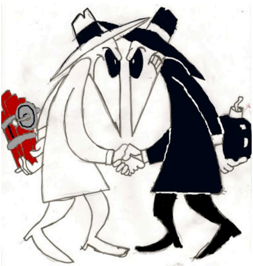
Spy Vs. Spy

So, for Facebook in China, exactly who is watching who here?